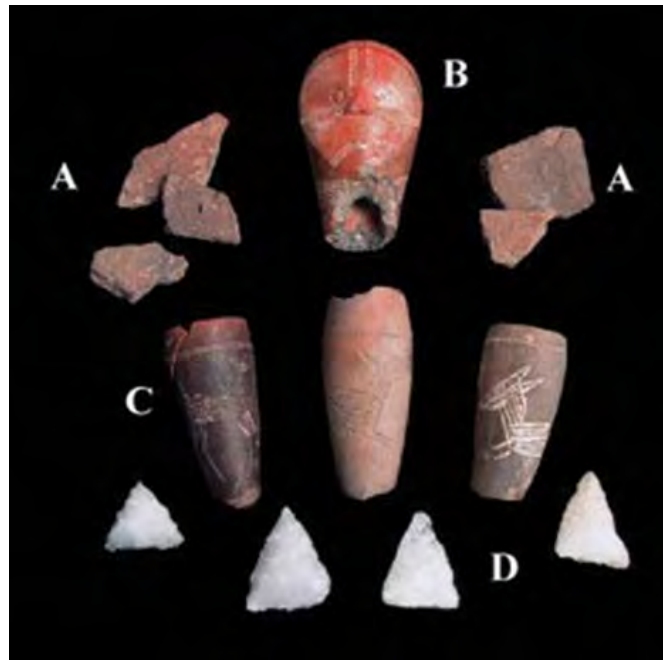
Native American artifacts from St. Mary's City

Below are a few of the artifacts found in the Visitor Center Welcome Exhibit.