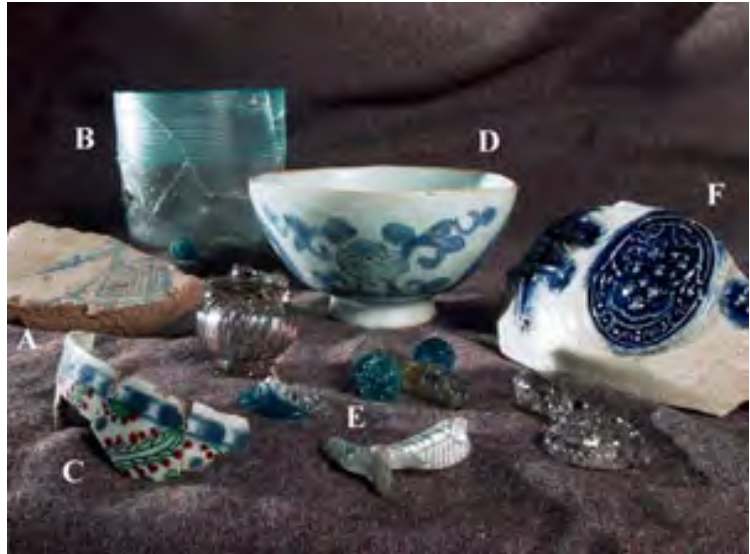
Exotic artifacts from St. Mary's City