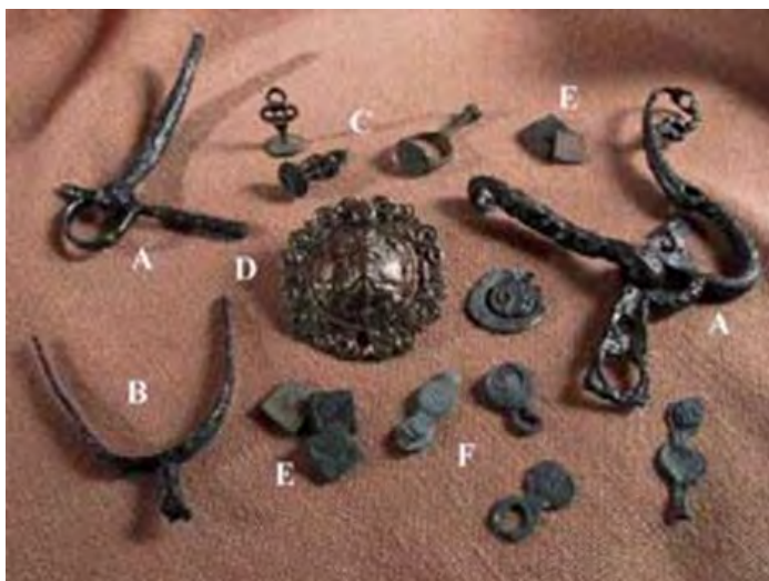
Trade and Travel related artifacts from St. Mary's City