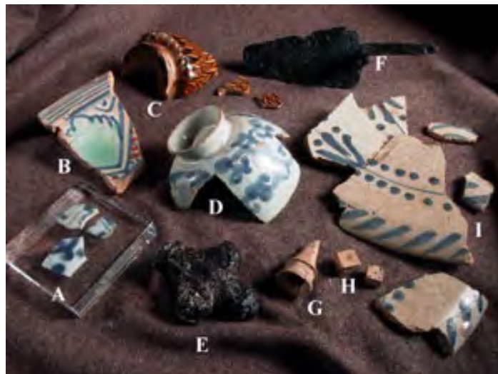
Artifacts from St. John's