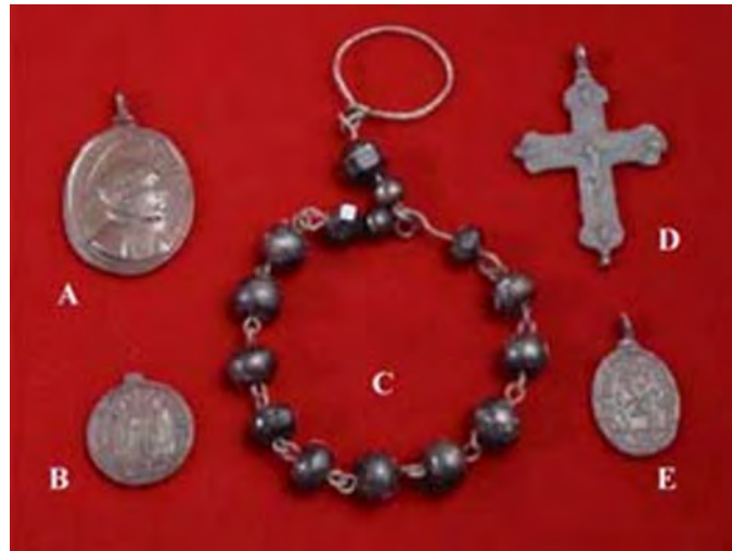
Roman Catholic Religious items from St. Mary's City