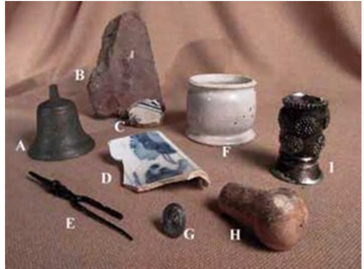
Artifacts from the Van Sweringen site