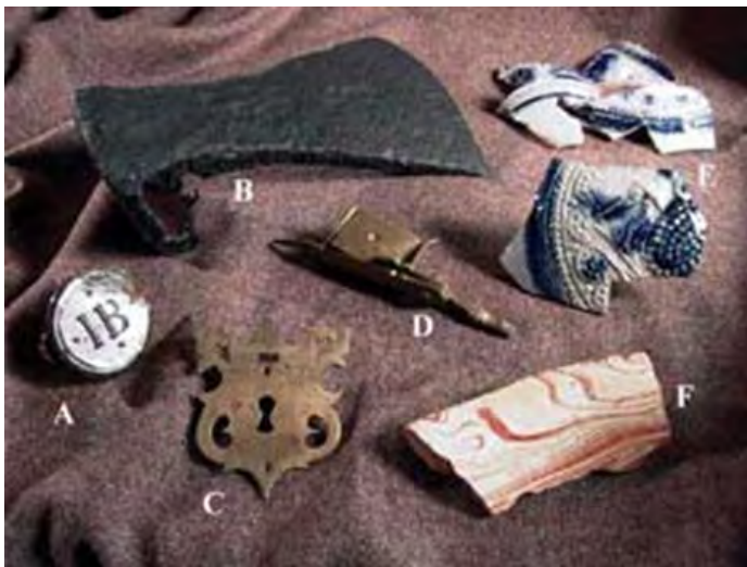
Artifacts from the Leonard Calvert House