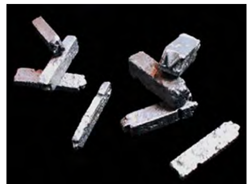
Lead Printing Type from the Nuthead Press