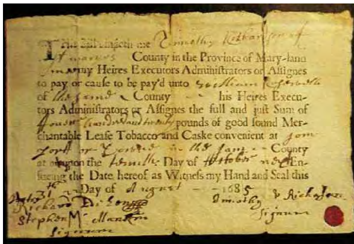
Document printed on the Nuthead Press in 1685