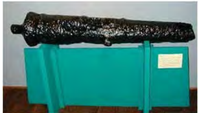
Iron Cannon of a type called a saker