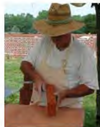
...checking for a true plane...